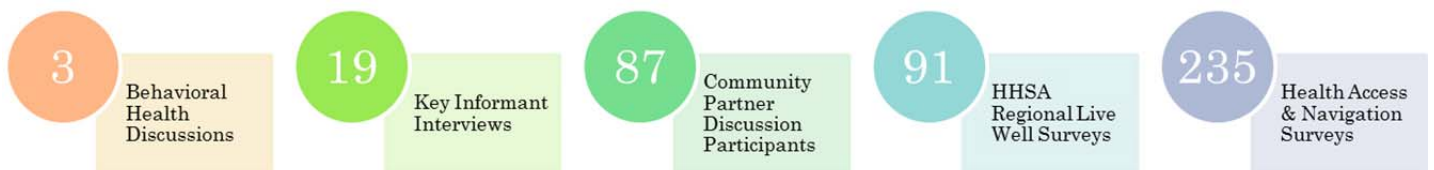
Figure 4: HASD&IC 2016 CHNA Community Engagement Activities

Based on the results of the community health statistics scan and feedback from community partners received during the 2016 CHNA planning process, a number of community engagement activities were conducted across SDC, as well as specific to SMC, in order to provide a more comprehensive understanding of the identified health needs, including their associated social determinants of health and potential system and policy changes that may positively impact them. In addition, a detailed analysis of how the top health needs impact the health of San Diego residents was conducted. Figure 4 below outlines the number and type of community engagement activities conducted as part of the collaborative, HASD&IC 2016 CHNA, including: key informant interviews, facilitated discussions with care coordinators (community partner discussions), and community resident input through a Health Access and Navigation Survey.