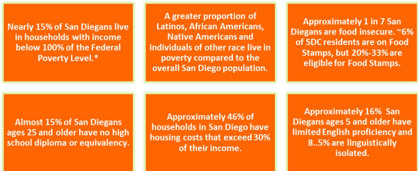
Figure 2: Selected Community Health Statistics, SDC 2

*Federal Poverty Level (FPL) is a measure of income issued every year by the Department of Health and Human Services. In 2016, the FPL for a family of four was $24,300.