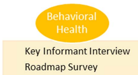
Figure 5: SMC 2016 CHNA Community Engagement Activities

Sharp also contracted with IPH to collect additional community input through three primary methods: facilitated discussions, key informant interviews, and the Health Access and Navigation Survey (the “Roadmap” in Figure 5 below). For SMC, input focused on behavioral health with key informant interviews and completion of the Health Access and Navigation Survey by patients and community members that participate in SMC’s Aftercare program. The Aftercare program helps substance abuse/behavioral health patients maintain a sober lifestyle with support through the necessary transitions at home, work and in the community. Figure 5 below outlines the engagement activities specific to the SMC 2016 CHNA.