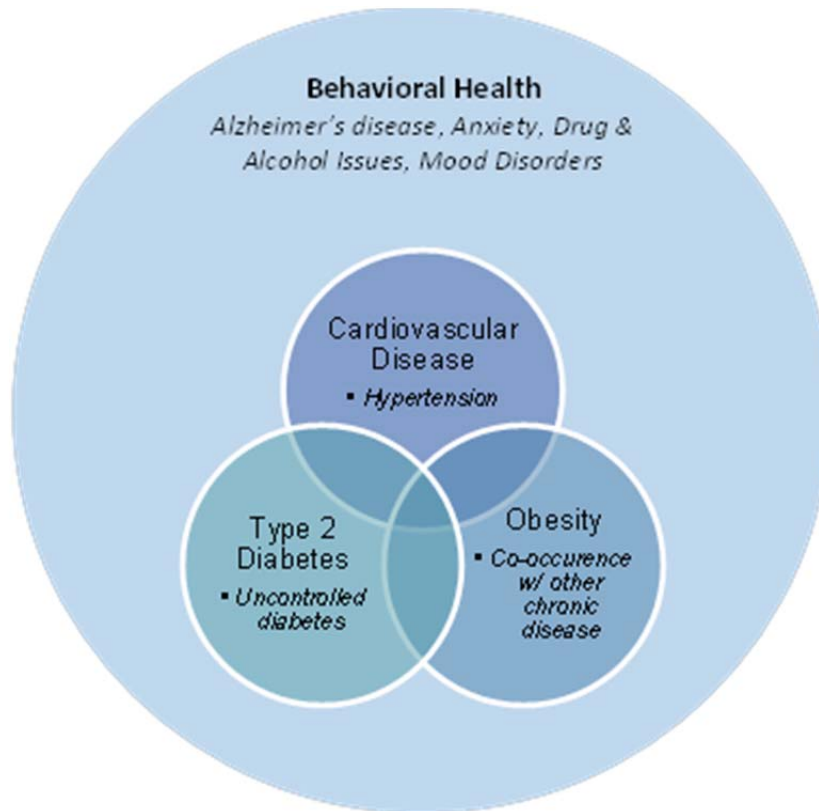
Figure 6: HASD&IC 2016 CHNA Top Health Needs

As the HASD&IC 2016 CHNA process included robust representation from the communities served by SMC, the findings of the prioritization process also apply to the identified health need of behavioral health for SMC. Although additional priority health needs were prioritized and analyzed for SDC through the collaborative HASD&IC 2016 CHNA process, as a specialty hospital providing chemical dependency programs and services, these identified priority health needs – cardiovascular disease, diabetes and obesity – fall outside the scope of services provided by SMC, and thus are not addressed through SMC's programs or activities. However, in light of these findings, SMC is currently exploring partnerships and programs that address the connection between behavioral health and physical health conditions.