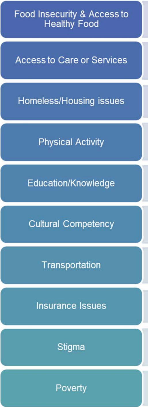
Figure 7: Social Determinants of Health, HASD&IC 2016 CHNA